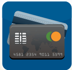
Credit Card Fees