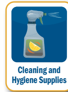
Cleaning and Hygiene Supplies

Our specialist experts cover PDQ machine rental and merchant bank fees and are independent of the end providers.