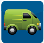
Parcel Courier Services